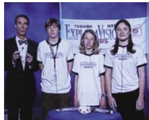
Accompanied by "Bill Nye the Science Guy," the winning students were interviewed by television news stations across the country.